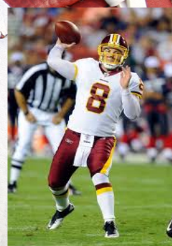
REX GROSSMAN Washington Redskins University Of Florida 3-Year Camper, Bloomington South HS