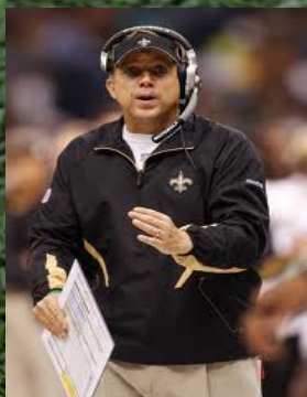
SEAN PAYTON Superbowl Champions New Orleans Saints Eastern Illinois University 3-Year Camper 5-Year Camp Instructor

Register today on our website! www.BISHOPDULLAGHAN.com