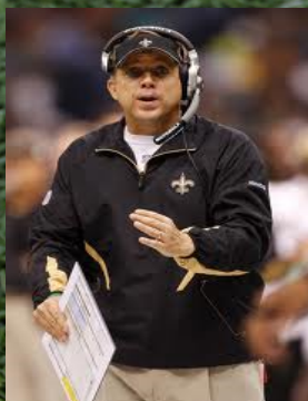
SEAN PAYTON Superbowl Champions New Orleans Saints Eastern Illinois University 3-Year Camper 5-Year Camp Instructor

Register today on our website! www.BISHOPDULLAGHAN.com