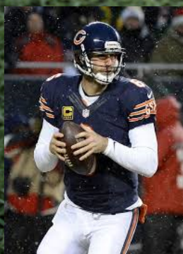
JAY CUTLER Chicago Bears Vanderbilt University Heritage Hills HS 3-Year Camper