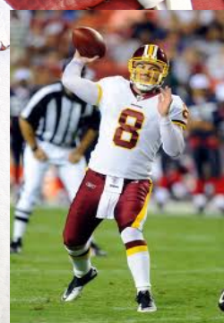
REX GROSSMAN Washington Redskins University Of Florida 3-Year Camper, Bloomington South HS